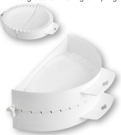
43609 • Grande Empanada Press PL, 7" (bx)