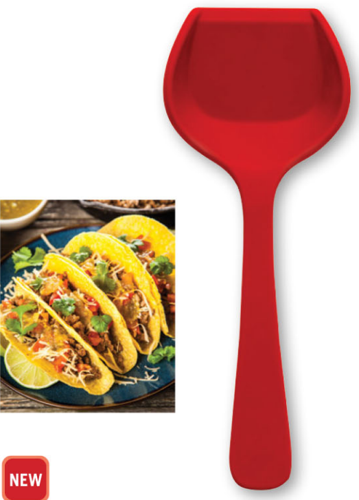
43828 • The Taco Shovel™ Silicone, 8 1/2" x 3 1/2" (cd)